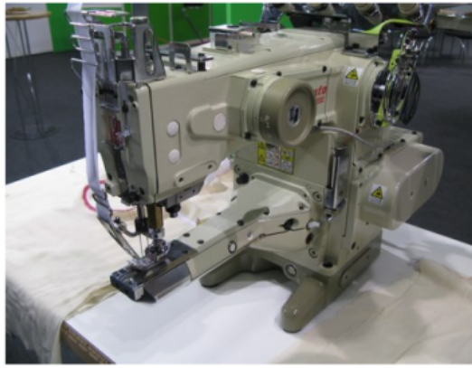
Feed-Up-The-Arm- Interlock Stitch Machine prepared for attaching tape Shoulder-to-Shoulder