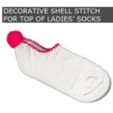
DECORATIVE SHELL STITCH FOR TOP OF LADIES' SOCKS