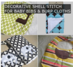
DECORATIVE SHELL STITCH FOR BABY BIBS & BURP CLOTHS