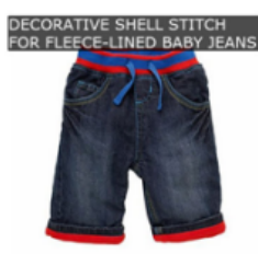
DECORATIVE SHELL STITCH FOR FLEECE-LINED BABY JEANS