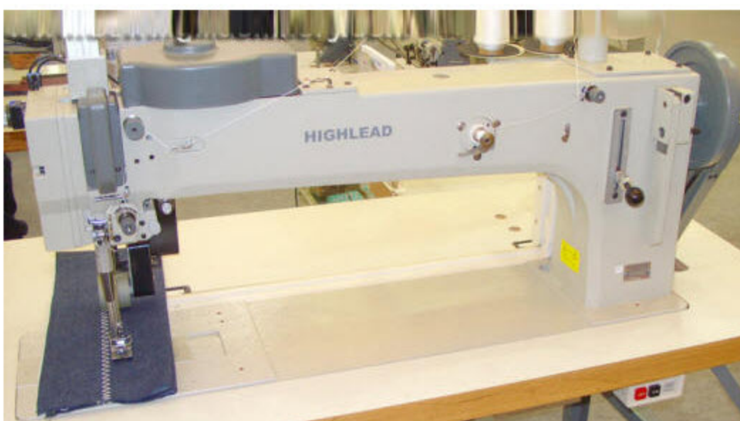
Highlead GG80018-760HA-P2 extra heavy long and high arm Zigzag