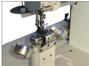
Post bed with Walking foot & Large hooks