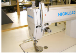
Easy threading and tension adjustment