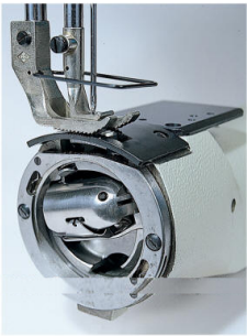
Extra heavy duty cylinder arm shape with extra large shuttle hook & triple feeding action